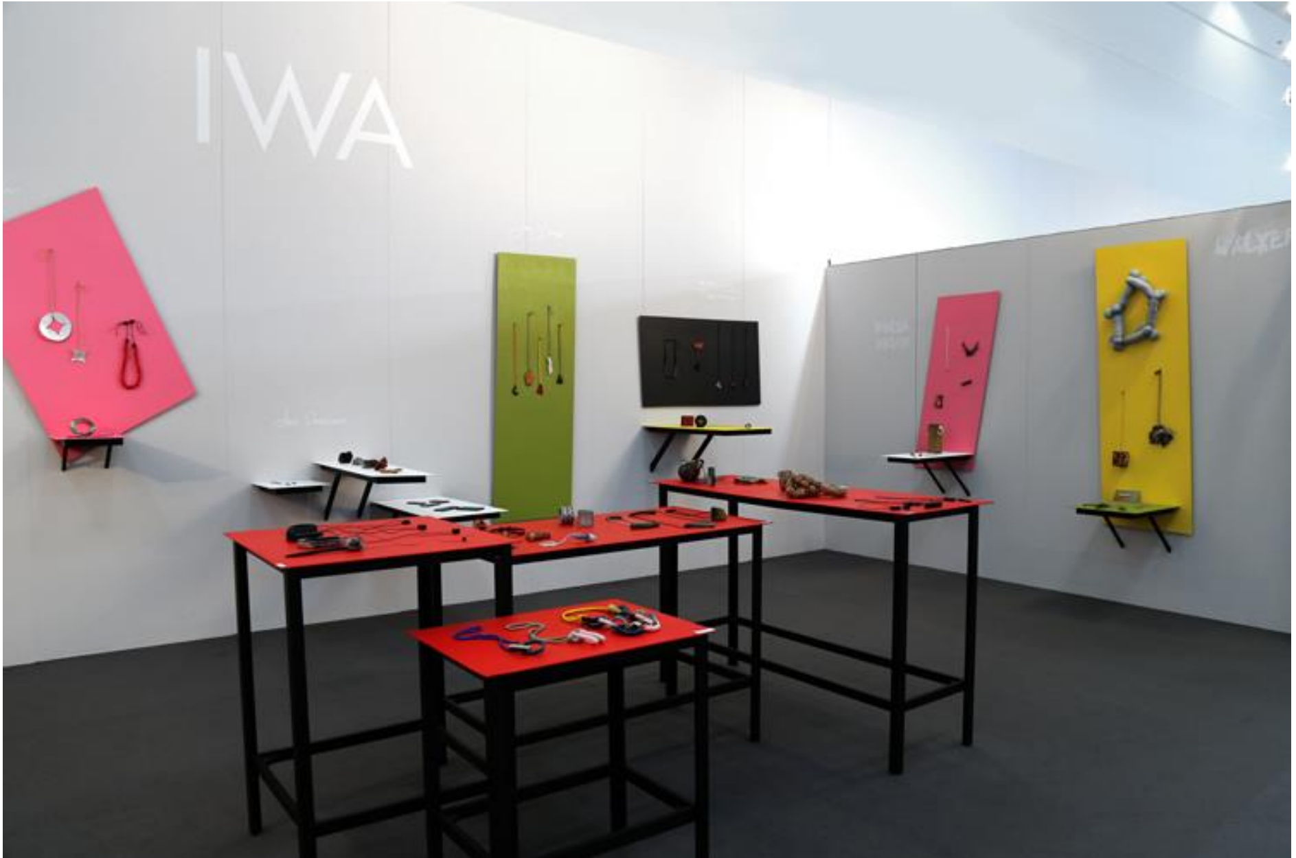
IWA overview shows featured NZ artists on the walls and selected NZ works on the tables