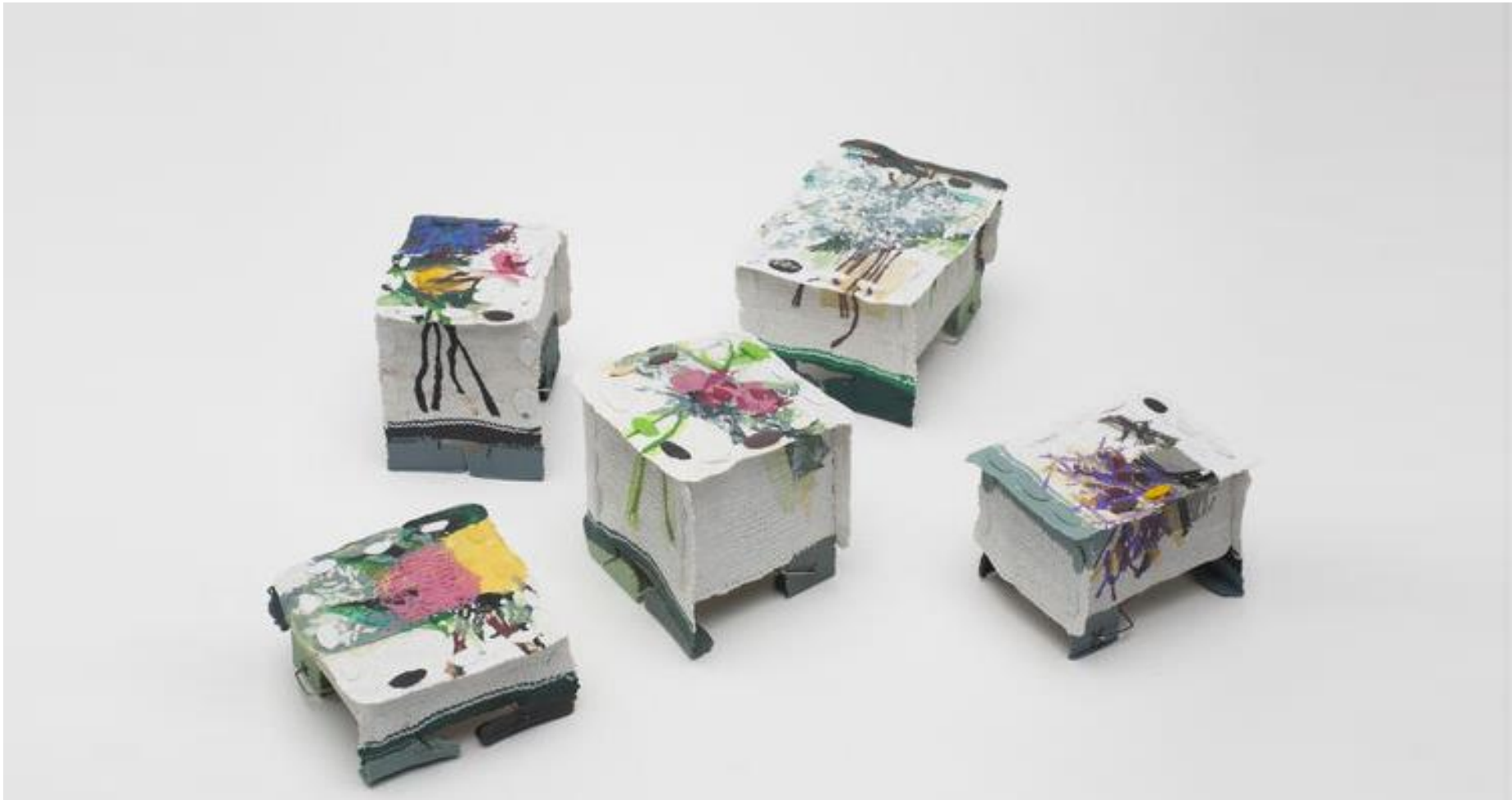
Shelley Norton, Nest of Brooches 2017. Plastic, sterling silver, stainless steel.

Shelley Norton is a contemporary jeweller based in Auckland, New Zealand. Taking a transformative and process orientated approach to materials, Norton's work examines notions of how meaning is manufactured in a playful manner.